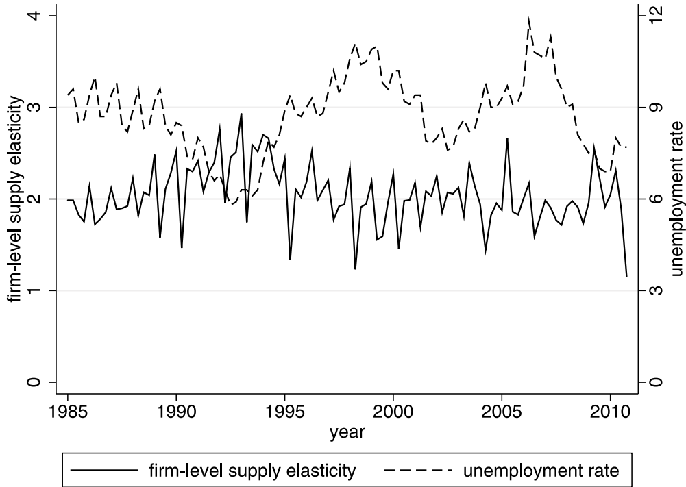
Figure 3: Lagged aggregate unemployment rate and estimated firm-level labour supply elasticity when allowing interactions with quadratic unemployment

Notes: The data sets used are a 5 per cent random sample of the IEB and a quarterly version of the BHP, 1985–2010. The separation rate and recruitment elasticities are estimated using the results from Table 9. The weights are calculated using quarterly sample averages. The firm-level labour supply elasticity is estimated using equation (10).