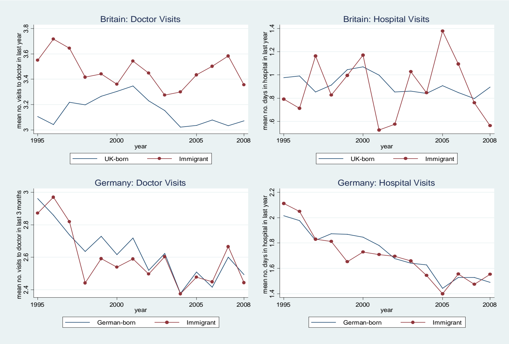
Figure 1. Number of Visits to Doctors and Hospital by Time