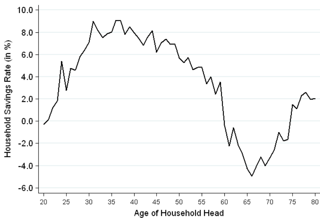
Figure 1: Age profiles of the household savings rate

Notes: Weighted by population weights. EVS data (1998, 2003, 2008).