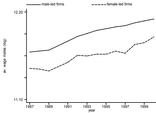
panel A, male wages