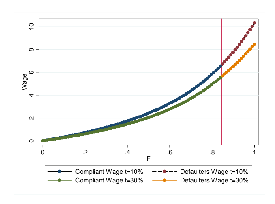
Figure 2: Defaulters and compliers inverse wage offer distributions for tax rates of 10% and 30% and endogenous productivity.

Notes: We make the additional assumption that \sigma =2 for this graph