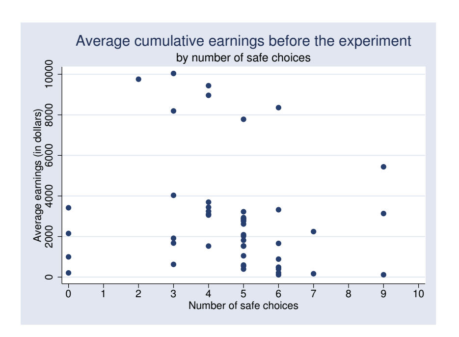
Figure 1: Scatterplot of earnings accumulated before the experiment and the number of safe decisions taken in the baseline experiment. All 51 tree planters.