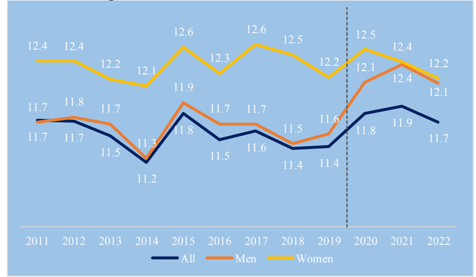
Figure 1: Overall Rate of Return Over Time

pandemic level at 11.7 in 2022. These changes are significant (Annex Table 2) and larger than the changes that occurred earlier. In 2021, the average return to schooling increased by 0.5 percentage points in comparison to 2019. By 2022, the average return was 11.7 percent, which is the same as it was in 2011. The increase in the returns to schooling for men was also significant and even higher, reaching a peak of 12.4 percent in 2021 and remaining above pre-pandemic levels at 12.1 in 2022. The average return to a year of schooling increased by 0.8 percentage points relative to 2019. For women, the returns also increased during the first two years of the pandemic from 12.2 in 2019 to 12.5 and 12.4 in 2020 and 2021, respectively. However, those changes were not significant and female returns went back to their pre-pandemic level in 2022.