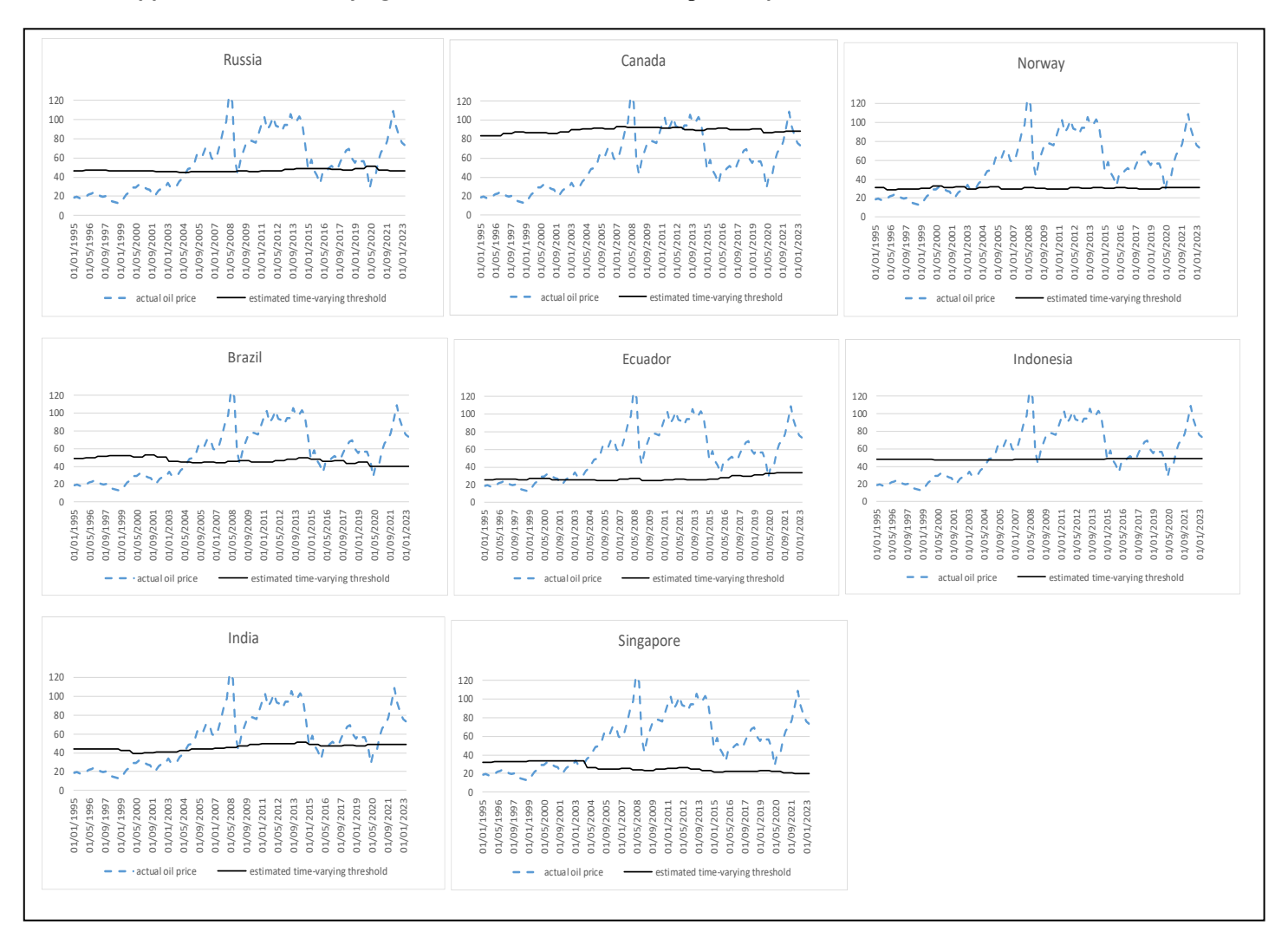
Figure 4: Authors' computations