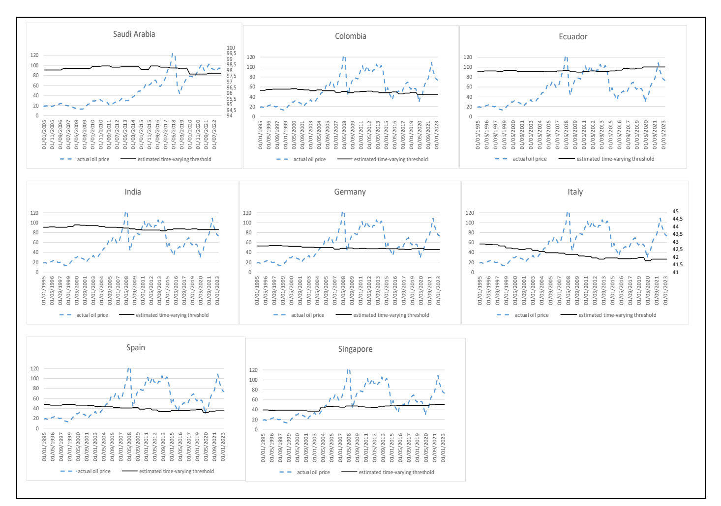
Figure 3: Authors' computations