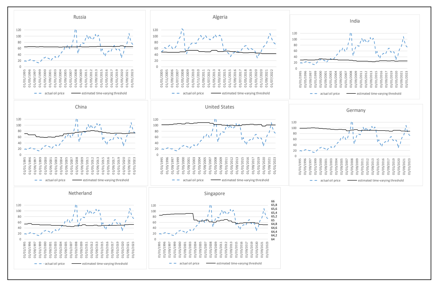
Figure 5: Authors' computations