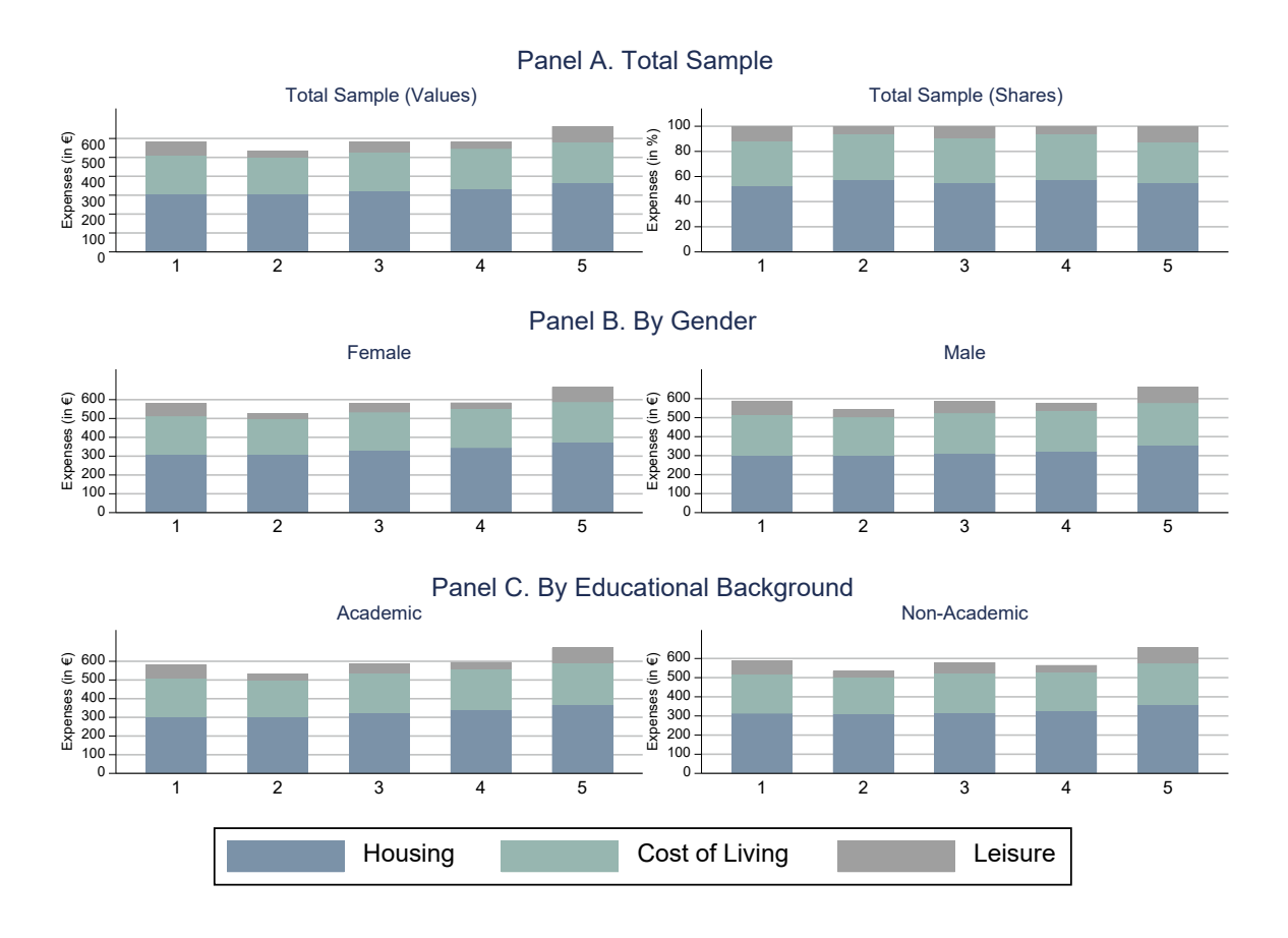
Fig. 2. Students' monthly expenses and composition by phase of the pandemic. Notes: Panel A is the total sample with a set of 592 students. Panel B differentiates the total sample by gender into women (344) and men (248). Panel C differentiates the total sample by parental background of the students into an academic (315) and a non-academic (277) background group. The academic background group includes students with at least one parent with a tertiary degree. See Appendix Table A.5 for corresponding descriptive statistics. Own calculations with data from Leibniz University Hannover student survey, 2021.