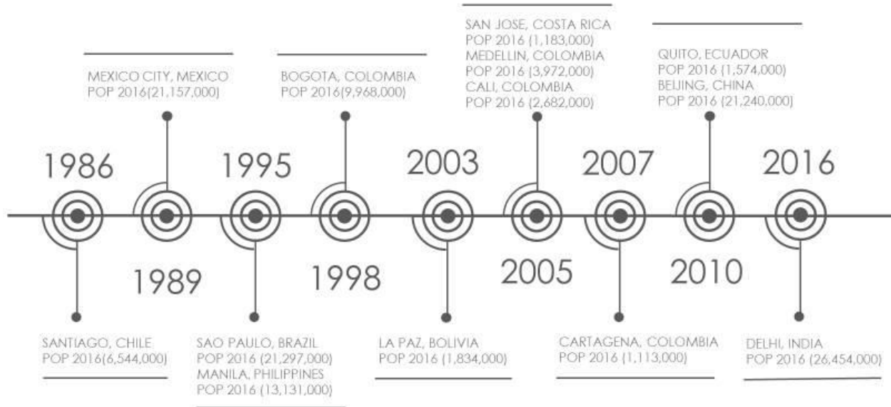
Figure 2. Timeline of driving restriction policies around the world